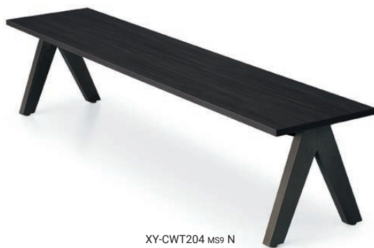
XY-CWT204 MS9 N